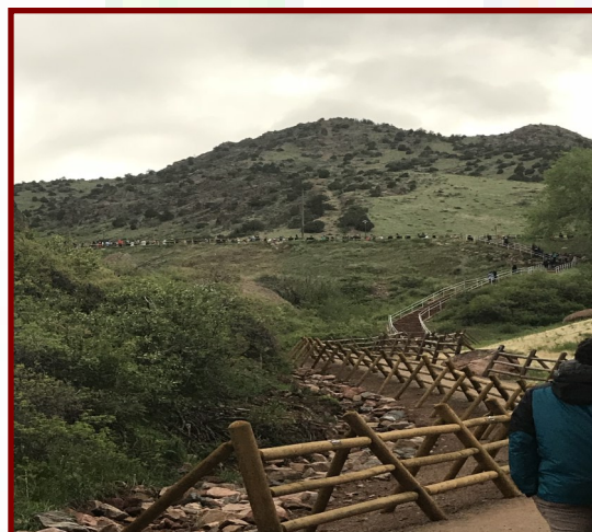
If you haven't been to the Red Rocks Amphitheatre in Morrison, CO—it's an amazing venue. There is a small hike up to the venue, but worth it. Good add for your bucket list!!