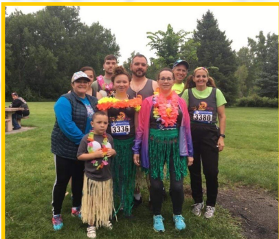
Team Breakfast Exchange Scrambled Legs won the largest team category with 12 team members! (A few didn't make it in time for team photos.)

If you didn't come out and participate in the Island X Adventure Run, you missed a fun time!